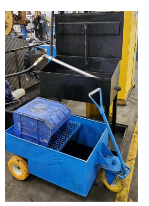
Example: Manual Parts Washer / Oil Cart