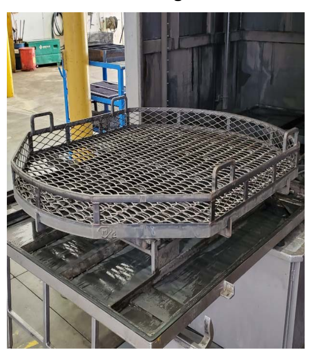
Example: Quadra JET Model 250 – component turntable.