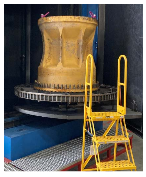
Example: StingRay Parts Washer – component placement center of turntable.