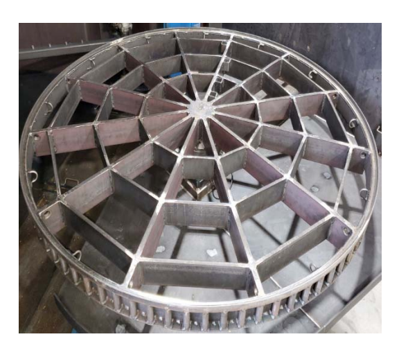
Example: StringRay Turn Table.