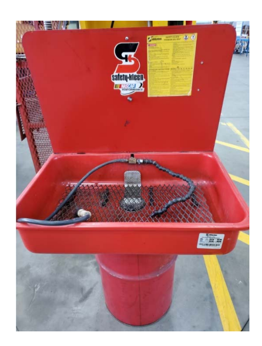
Example: Manual Parts Washer